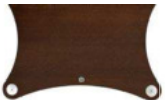
Mocca Stained Oak Veneer