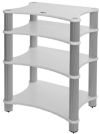
Solo 4 - 680 mm