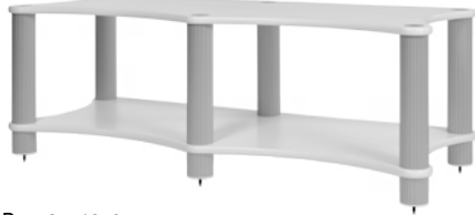
Duo 2 - 1270 mm