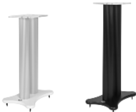
Speaker stand available in 2 sizes, 620 and 720