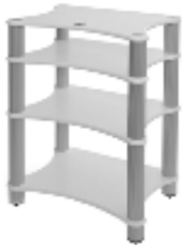
Solo 4 - 680 mm