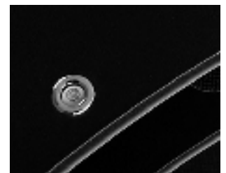
Spirit level integrated in Solo 2 to 6