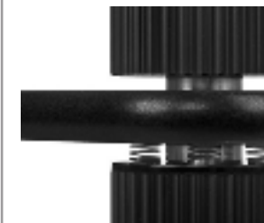
Optional isolation system