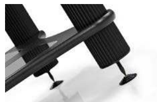
Optional floor protectors in black