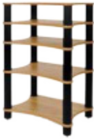
Solo 5 - 680 mm