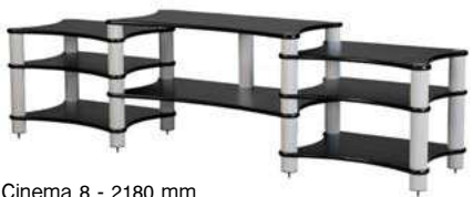
Cinema 8 - 2180 mm