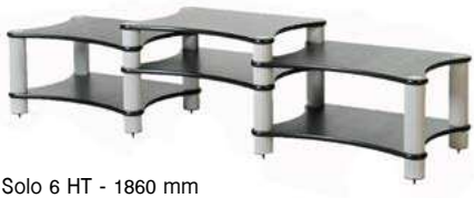
Solo 6 HT - 1860 mm