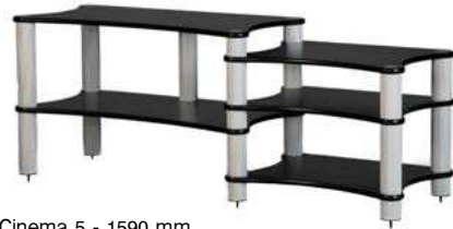
Cinema 5 - 1590 mm