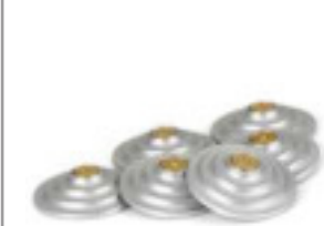
Optional Floor protectors in silver