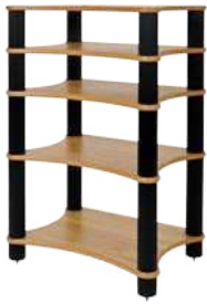
Solo 5 - 680 mm