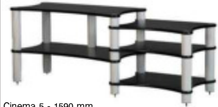
Cinema 5 - 1590 mm