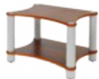
Solo 2 - 680 mm