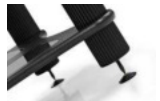
Optional floor protectors in black