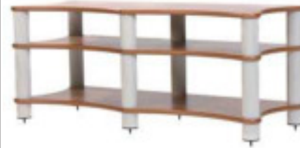
Duo 3 - 1270 mm