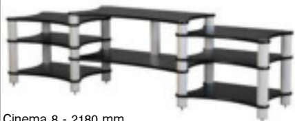
Cinema 8 - 2180 mm