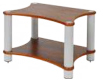
Solo 2 - 680 mm