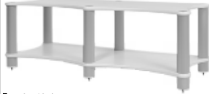
Duo 2 - 1270 mm