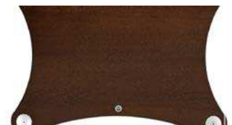
Mocca Stained Oak Veneer