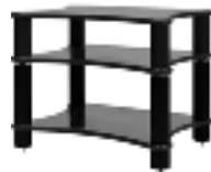
Solo 3 - 680 mm