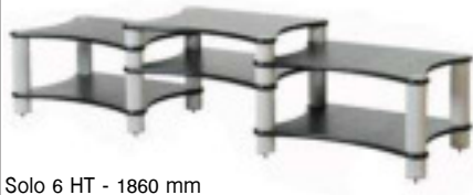
Solo 6 HT - 1860 mm