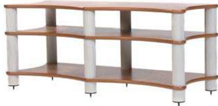
Duo 3 - 1270 mm