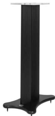
Speaker stand available in 2 sizes, 620 and 720