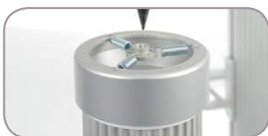
Hybrid and Hybrid full length

The Hybrid Isolation System consists of a special version of our Disc of Silence isolator that is attached to the pillar.