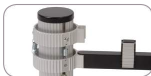
Rack of Silence

The Hybrid Isolation System consists of a special version of our Disc of Silence isolator that is attached to the pillar.