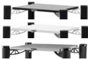
Shelves in black, white or concrete

Hybrid building blocks: The Shelf-kit (shelves and extrusion) and corner pillars