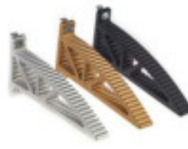
Extrusion in silver, copper or black aluminium