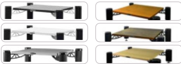
Shelves in black, white, concrete, walnut, cherry and oak

Hybrid building blocks: The Shelf-kit (shelves and extrusion) and corner pillars