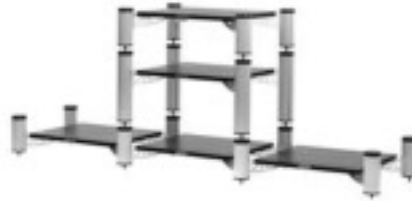
5-shelf-kit design example