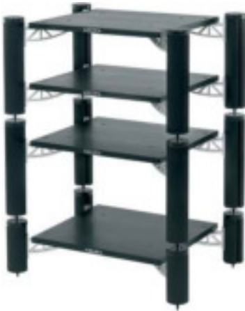
4-shelf-kit design example

Example designs using the four building blocks: Shelf-kit, and corner pillars in three different sizes