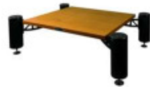
1-shelf-kit design example