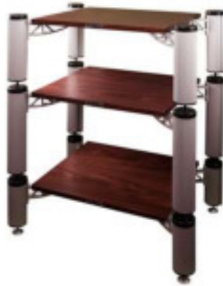
3-shelf-kit (Silver anodized pillars with Walnut vaneered shelves)