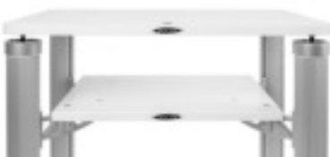
Turn table shelf in black or white colour texture