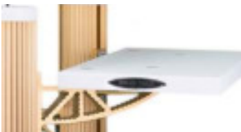
Sideboard in black or white colour texture