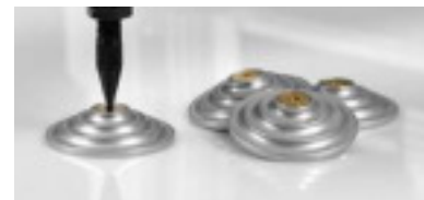
Optional floor protectors in black or silver