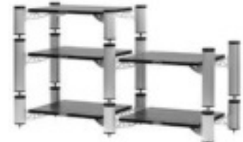
5-shelf-kit design example

Hybrid building blocks: The Shelf-kit (shelves and extrusion) and corner pillars