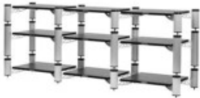
9-shelf-kit design example