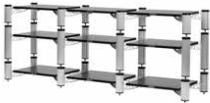
9-shelf-kit design example