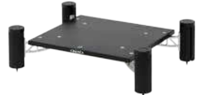
1-shelf-kit design example