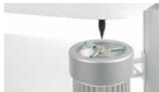
Optional isolation system in silver, copper or black