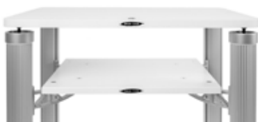
Turn table shelf in black or white colour texture