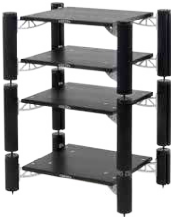
4-shelf-kit design example

Example designs using the four building blocks: Shelf-kit, and corner pillars in three different sizes