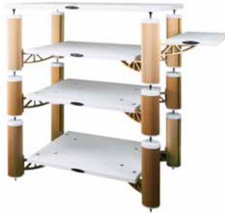
3-shelf-kit + Large turntable design example