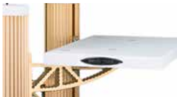
Sideboard in black or white colour texture