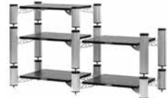
5-shelf-kit design example

Hybrid building blocks: The Shelf-kit (shelves and extrusion) and corner pillars