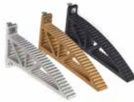
Extrusion in silver, copper or black aluminium