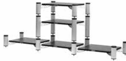
5-shelf-kit design example