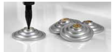
Optional floor protectors in black or silver