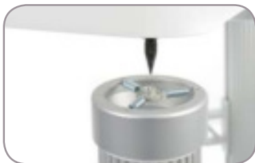
Hybrid and Hybrid full length

The Hybrid Isolation System consists of a special version of our Disc of Silence isolator that is attached to the pillar.