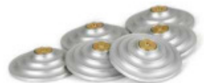
Optional floor protectors in black or silver