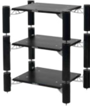
3-shelf design example