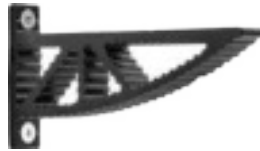
Extrusion in silver, copper or black