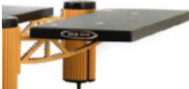
Sideboard in black or white color texture