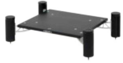
1-shelf design example