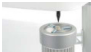
Optional isolation system