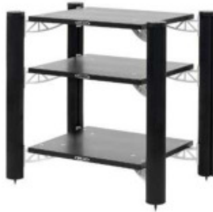
Example of rack design with 670 mm corner pillars and three shelf kits