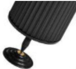
Floor protectors in Black or silver