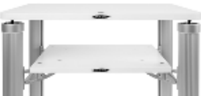
Turn table shelf - 695 x 520 x 22 mm (LxWxD)