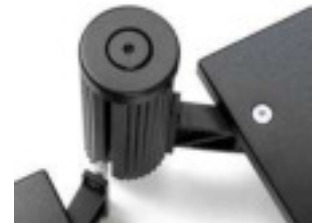
Shelves are fully adjustable along the corner pillars