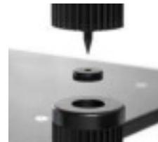
Hybrid isolation disc and spike