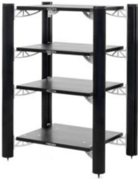
Example of rack design with 900 mm corner pillars and four shelf-kits

Hybrid offers an endless amount of rack designs because of its modular system