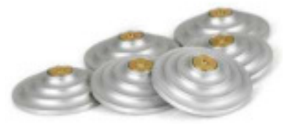
Optional floor protectors in black or silver