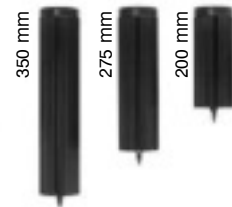
3 different pillar lengths in silver, copper or black