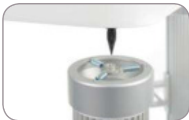
Hybrid and Hybrid full length

The Hybrid Isolation System consists of a special version of our Disc of Silence isolator that is attached to the pillar.