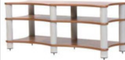
Duo 3 - 1270 mm