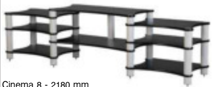
Cinema 8 - 2180 mm