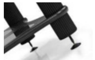
Optional floor protectors in black