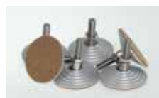
"Spike Fixed Floor Protector" in silver or black