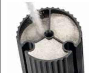
Pillars can be filled with sand