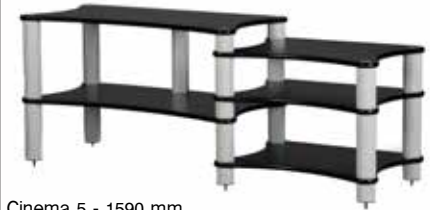
Cinema 5 - 1590 mm