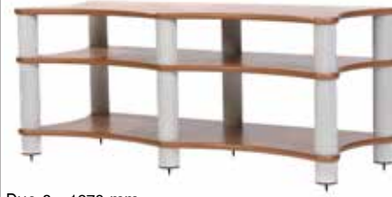
Duo 3 - 1270 mm