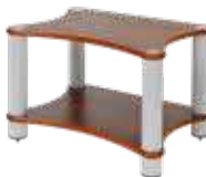
Solo 2 - 680 mm