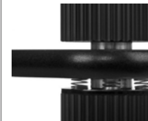
Middle shelf isolation