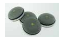
"Feet of Concrete" in silver or black