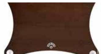
Mocca Stained Oak Veneer