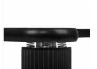
Top shelf isolation