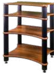
Solo 4 - 680 mm