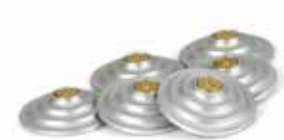
"Floor protector" in silver or black