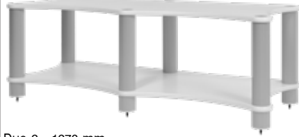
Duo 2 - 1270 mm