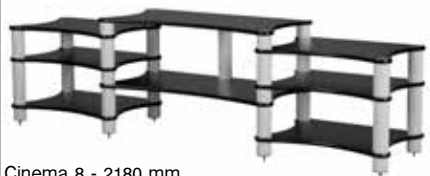
Cinema 8 - 2180 mm