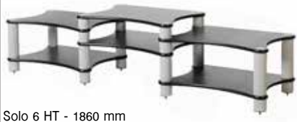
Solo 6 HT - 1860 mm