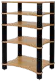
Solo 5 - 680 mm