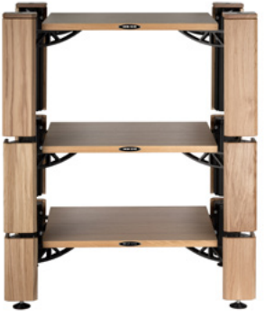
3-shelf-kit design example