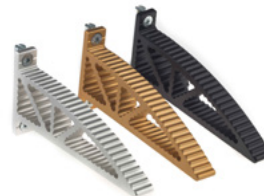
Extrusion in silver, copper or black aluminium