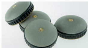
Feet of Concrete