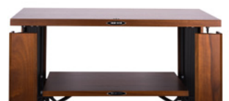
Turn table shelf in black oak, Oak, Walnut and Cherry