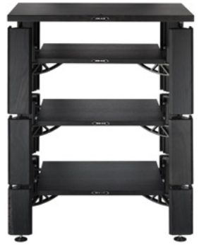
3-shelf-kit design example