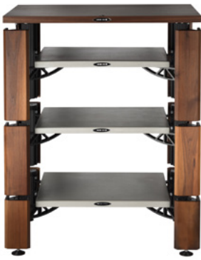
3-shelf-kit design example

Example designs using the four building blocks: Shelf-kit, and corner pillars in three different sizes