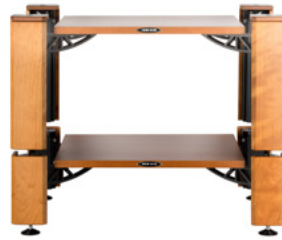
2-shelf-kit design example