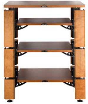
3-shelf-kit design example

Hybrid Wood building blocks: The Shelf-kit (shelves and extrusion) and corner pillars