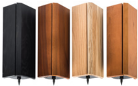
Corner pillars in black oak, walnut, oak and cherry

Hybrid Wood building blocks: The Shelf-kit (shelves and extrusion) and corner pillars