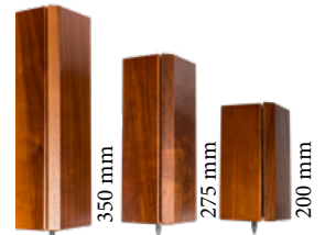
Three different pillar lengths