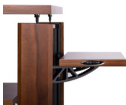
Sideboard in black oak, Oak, Walnut or Cherry