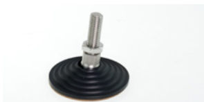
Spike Fixed Floor Protector