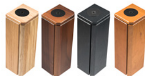
Top lid in oak, walnut, black oak and cherry