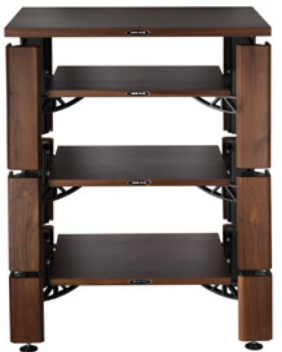
3-shelf-kit design example