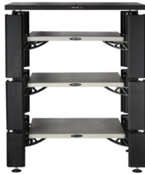
3-shelf-kit design example