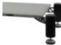
Feet of Concrete