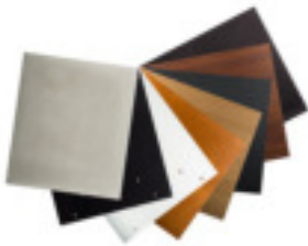
Shelves in concrete, black, white, cherry, oak, black oak, walnut and carbon

Hybrid building blocks: The Shelf-kit (shelves and extrusion) and corner pillars