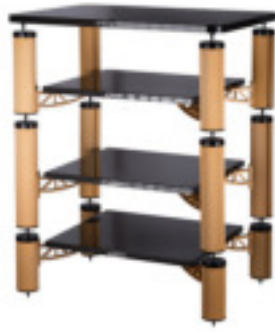
3-shelf-kit and top shelf design example