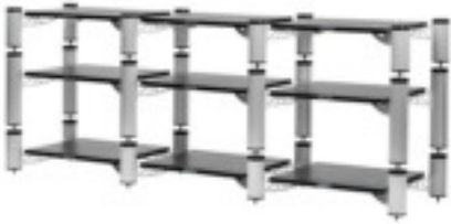
9-shelf-kit design example