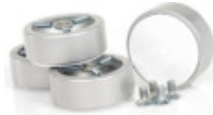
Optional isolation system in silver, copper or black