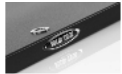
Bubble level is optional for the standard shelves