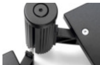
Shelves are fully adjustable along the corner pillars