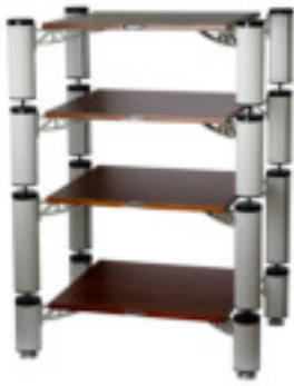
4-shelf-kit design example

Example designs using the four building blocks: Shelf-kit, and corner pillars in three different sizes