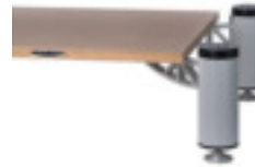
Spike Fixed Floor Protector