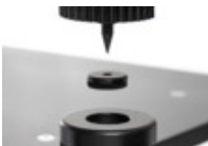
Internal bracing to keep resonance low