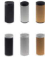
Corner pillars three different anodized aluminum and two top lid colors