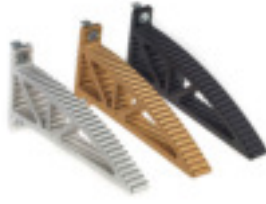
Extrusion in silver, copper or black aluminum