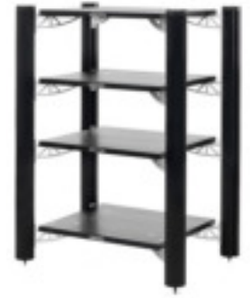
3-shelf-kit with Hybrid Full Length design example