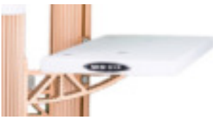
Sideboard in black, white, walnut, cherry, oak and black oak