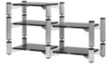
5-shelf-kit design example

Hybrid building blocks: The Shelf-kit (shelves and extrusion) and corner pillars