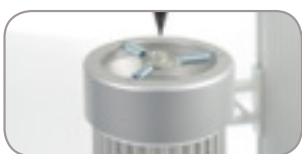
Hybrid and Hybrid full length

The Hybrid Isolation System consists of a special version of our Disc of Silence isolator that is attached to the pillar.