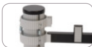
Rack of Silence

The Hybrid Isolation System consists of a special version of our Disc of Silence isolator that is attached to the pillar.