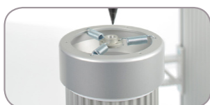
Hybrid and Hybrid full length

The Hybrid Isolation System consists of a special version of our Disc of Silence isolator that is attached to the pillar.