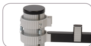
Rack of Silence

The Hybrid Isolation System consists of a special version of our Disc of Silence isolator that is attached to the pillar.