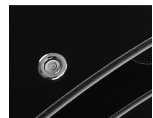
Spirit level integrated in Solo 2 to 6