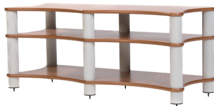
Duo 3 - 1270 mm