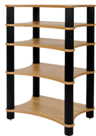
Solo 5 - 680 mm