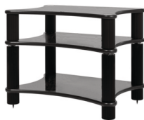
Solo 3 - 680 mm