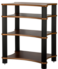
Solo 4 - 680 mm