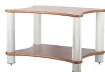
Solo 2 - 680 mm