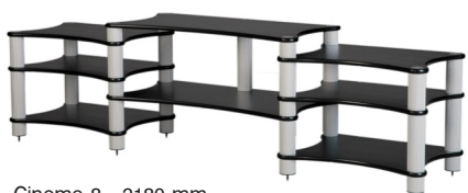
Cinema 8 - 2180 mm