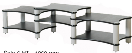
Solo 6 HT - 1860 mm