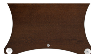
Mocca Stained Oak Veneer