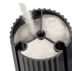
Pillars can be filled with sand