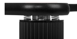
Top shelf isolation