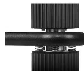
Middle shelf isolation