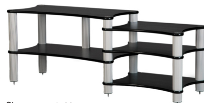
Cinema 5 - 1590 mm