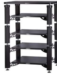
4 shelf-kit design