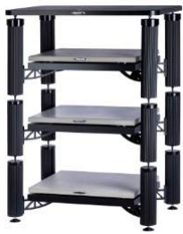
3 Isolation HD shelf-kit design