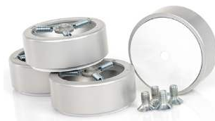
Optional isolation system in silver, copper or black