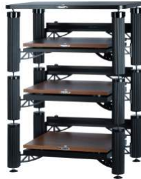
3 shelf-kit design with Isolation shelf-kit HD and top shelf