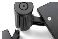
Shelves are fully adjustable along the corner pillars