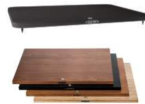
Veneered top table with bubble level in walnut, cherry, oak and black oak