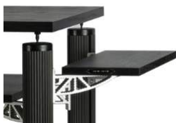
Sideboard in black, white, walnut, cherry, oak and black oak