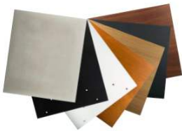
Shelves in concrete, black, white, cherry, oak, black oak, walnut. Concrete is only available as top in an isolation shelf HD