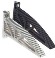
Extrusion in silver and black aluminum