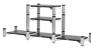
5-shelf-kit design side-by-side