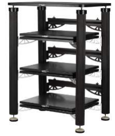
3 Isolation shelf-kit with Hybrid Full Length design and Cable Carriers