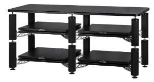
4-shelf-kit design side-by-side with double width top shelf