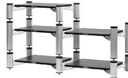
5-shelf-kit design side-by-side