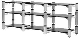
9-shelf-kit design side-by-side