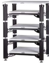
4 Isolation shelf-kit design with concrete shelves