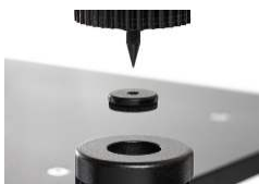
Internal bracing to keep resonance low