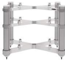
ROS 3 Reg.

Outer dimensions: 900x500x700mm (HxDxW) Between pillars: 520mm Total available space in-between strut shelves: 595mm 2x Max load basic strut shelf: 40kg 2x Max load HD strut shelf: 80kg