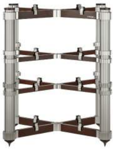
ROS 4 Ref.

Outer dimensions: 900x500x700mm (HxDxW) Between pillars: 520mm Total available space in-between strut shelves: 595mm 2x Max load basic strut shelf: 40kg 2x Max load HD strut shelf: 80kg