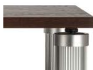
Top shelf isolator