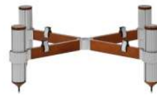
ROS 1 Reg.

Outer dimensions: 600x500x700mm (HxDxW) Between pillars: 520mm Total available space in-between shelves: 435mm 1x Max load basic strut shelf: 40kg 1x Max load HD strut shelf: 80kg