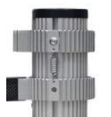
Integrated Isolation (Reference)