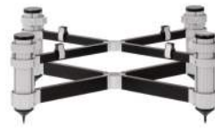
ROS 1 Ref.

Outer dimensions: 600x500x700mm (HxDxW) Between pillars: 520mm Total available space in-between strut shelves: 380mm 2x Max load basic strut shelf: 40kg 1x Max load HD strut shelf: 80kg