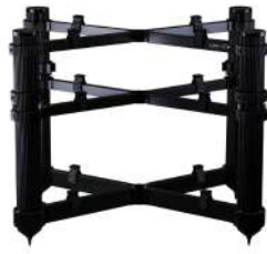
ROS 3 Ref.

Outer dimensions: 900x500x700mm (HxDxW) Between pillars: 520mm Total available space in-between strut shelves: 595mm 2x Max load basic strut shelf: 40kg 2x Max load HD strut shelf: 80kg