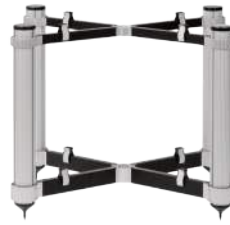
ROS 2 Reg.

Outer dimensions: 600x500x700mm (HxDxW) Between pillars: 520mm Total available space in-between strut shelves: 380mm 2x Max load basic strut shelf: 40kg 1x Max load HD strut shelf: 80kg